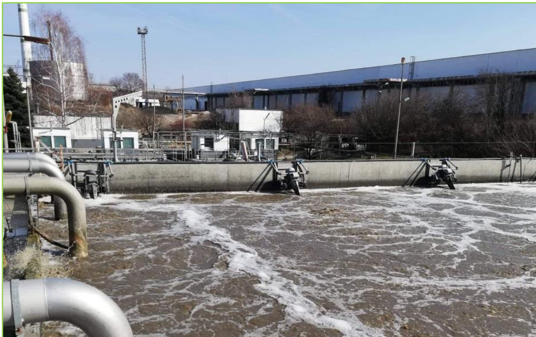
OxyStar Aerators on mounting bracket to support diffused aeration

At a paper mill in Bulgaria a retrofit to support existing diffusers was completed in 2014.